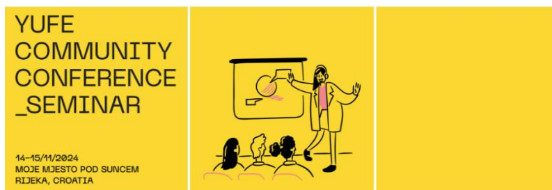
Figure 3 Social Media post

A dedicated subpage at the university website was created where all information about the conference were published and where a streaming link was provided (no pre-registration was required for the online participation).