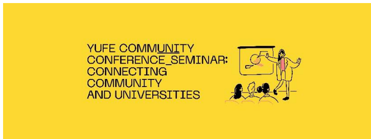
Figure 2 YUFE CONFERENCE visual

YUFE CommUNITY Conference 2024: connecting university & communities was the first edition of such as conference within YUFE Alliance. It was important to promote conference, not only