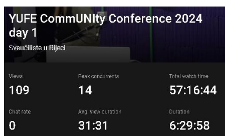
Figure 4 Analytics for the online participation_Day1

Following the event, recordings of key sessions will be uploaded also to the YUFE website and YouTube channel, accompanied by summaries and key takeaways to extend the conference's impact. A short digital report compiling insights from panelists and participants will be distributed in December 2024.