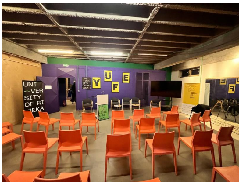
Figure 1 Conference Venue: My Place Under the Sun

During the 2-day event, ten cherry-picked initiatives were presented (from eight YUFE universities) together with the three guest lectures and two panel sessions with academic and community stakeholders.